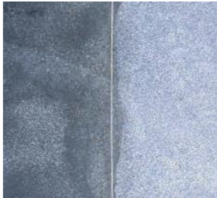
Before After (Removed WET COAT)